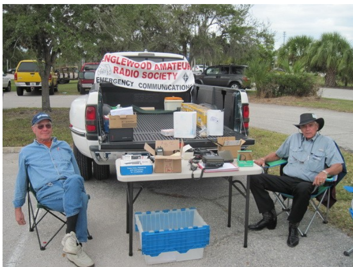
Tampa Hamfest nets about $300